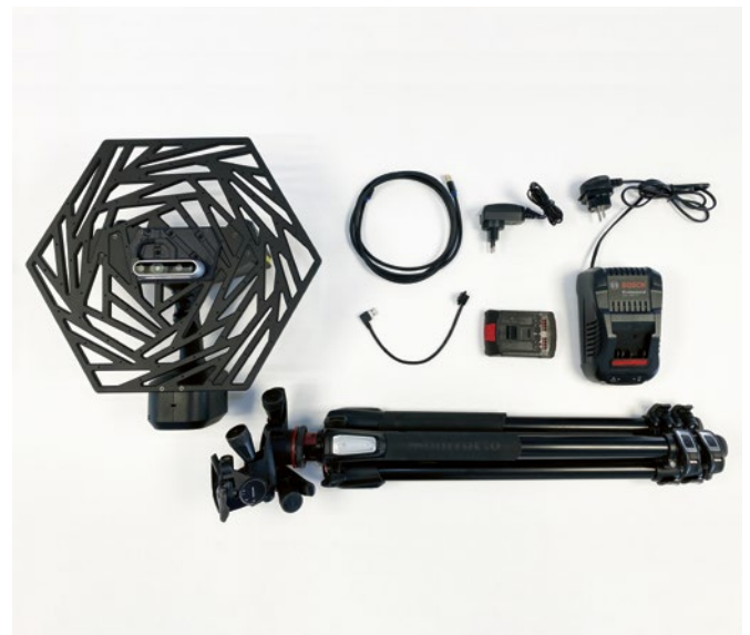
Acoustic Camera Mikado set

The array comes with an integrated Intel® RealSense™ depth camera which features Full HD resolution and the ability to record depth information.