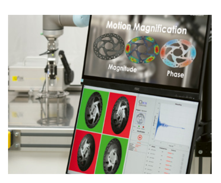
Example of the QAIros software modules