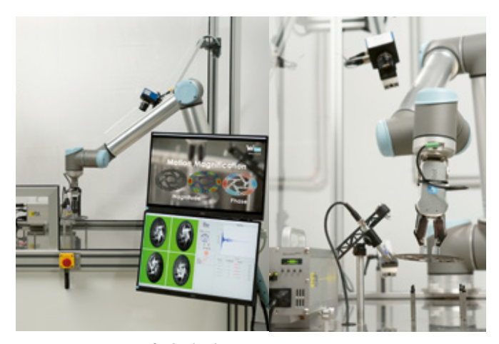
QAIros testing system for brake discs

Quality Assurance Using AI and Acoustic Fingerprint Technology